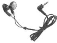
1 Set of Headphones