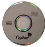
1 Software Disk