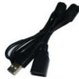
1 USB Extension Cord