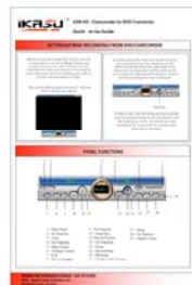
1 Quick Ref Guide