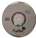
1 Software Disk